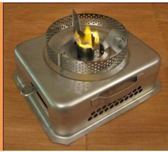
CleanCook Stove by Dometic AB

Monday, November 29 - Thursday, December 2, 2010 Embassy Suites 3285 Peachtree Rd N.E. - Atlanta, Georgia, USA